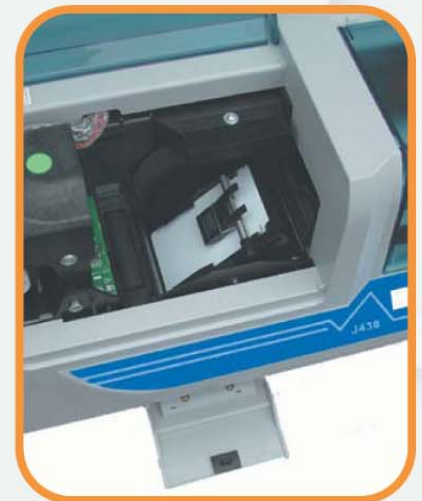
Integral flip-over unit for dual-sided printing

Designed and built to ISO 9001 certification standards. All specifications are subject to change without notice.